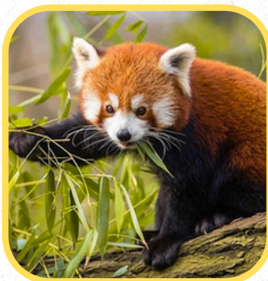
Zoo & HMI