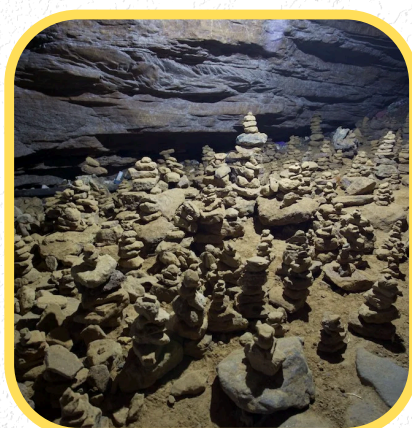
Gupteswar Cave Temple