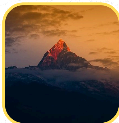
Sarangkot Sunrise Point