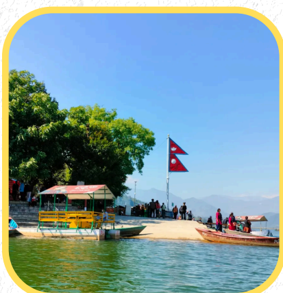
Tal Barahi Temple