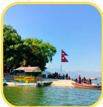
Tal Barahi Temple