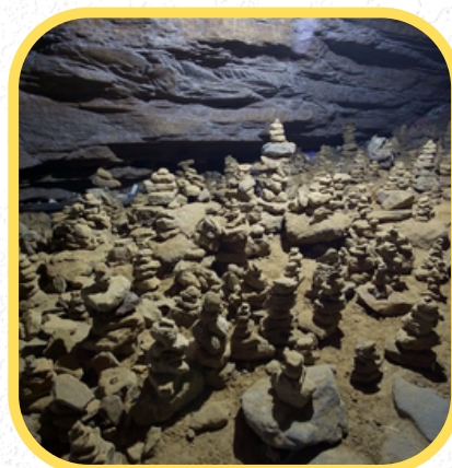
Gupteswar Cave Temple