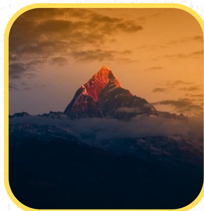
Sarangkot Sunrise Point